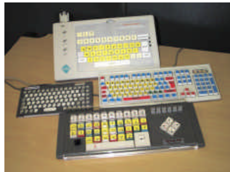
a range of alternatives for keyboard access

The keyboard is a complex device that many pupils are unable to use. There are many alternatives and adaptations to make text input easier. In group sessions where text input is required alternatives can be provided for some pupils. Writing letter-by-letter is a slow or impossible task for many pupils. Overlay keyboards and on-screen grids can be used to input whole words, phrases or sentences. A group could write co-operatively with some pupils using the keyboard while others choose words from a grid or overlay. Symbols and pictures can be used to support text to help pupils who have problems reading.