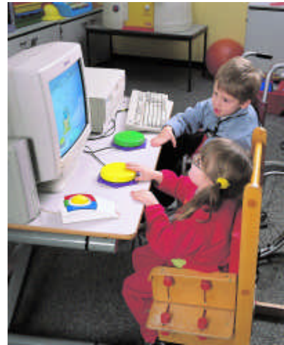
sharing and turn-taking using switches to access SwitchIt! Scenes