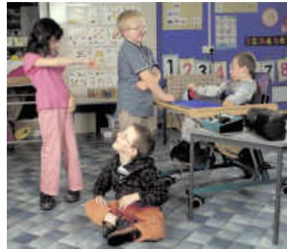
controlling the music for a musical game