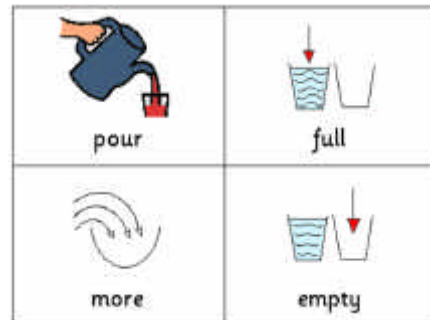
An overlay or communication chart to comment on and give instructions in a practical activity.

For more information, see Unit 3 – Language and communication and Unit 8 – The development of switching skills