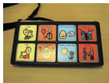
TechTalk speech output communication device

Pupils with speech and communication difficulties will be unable to contribute as easily as their peers. They may then be seen as having little to offer. Even when they have an alternative system of communication it is often only understood by the adults supporting the group and not by the other pupils. All the pupils in a group are unlikely to be able to see the message indicated by a pupil using a communication chart. Simple speech output communicators can be used in these situations to help the pupil make a contribution that can be heard by the rest of the group.