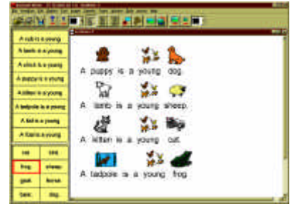
using picture support in Inclusive Writer

The computer can add to sessions by providing additional multi sensory resources such as talking books or picture-supported text. Pupils can contribute to the recording of a lesson by using whole word or picture grids while others spell words from the keyboard.