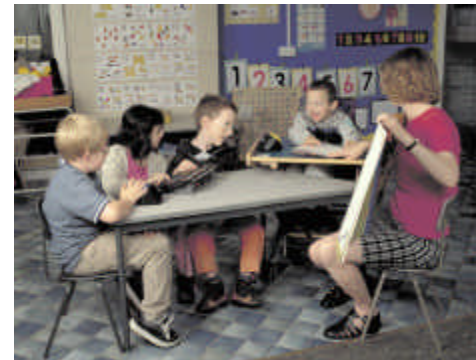
using technology in a story session

Some pupils will have personal communication systems or devices; these will often have to be set up in advance with messages that may be needed in particular sessions. It may be easier to use simple communicators that can be quickly programmed as required for some teaching sessions. The computer can also be used to provide additional communications materials, such as communication symbols and charts. It is a good idea if the teacher also makes use of a chart when working with a group. This will help reinforce the use of alternative communication systems.