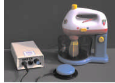
switch operation of a food mixer, through a control unit

John uses a PowerLink to operate a food mixer during a class session. He has to wait until instructed to switch on and off; he may even let someone else have a go if they ask nicely.