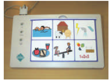
an overlay for 'talking' about the day's events

For more information, see Unit 3 - Language and communication and Unit 8 - The development of switching skills