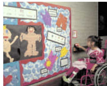
access to the display area