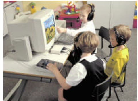
group listening without distracting the rest of the class, using microBob

Computer sound can be a distraction for some pupils; a simple pair of headphones can be used by a single pupil to cut down the level of sound. When a group of pupils are working together it is possible to use a distribution box, microBob, which allows up to six headphones to be used at the same time. Used with headsets, which have a microphone attached, it is possible for a group to talk to each other at the same time as using the software.