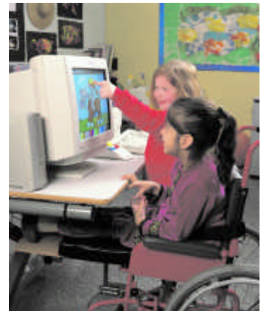
using a Touch Monitor for direct access