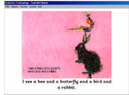
accessing a book using SwitchIt! Maker

It has been found that the school digital camera is able to take a good picture of the pages of the book, especially if the pictures are taken outside in bright light. These pictures have then been used to create a switch-operated story using SwitchIt! Maker .