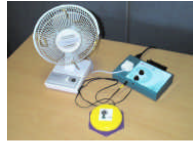
switch operation of a fan, through a PowerLink 2