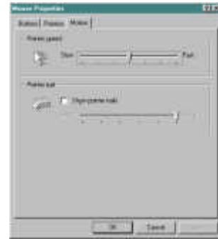
adjusting the mouse pointer speed in Windows