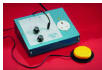
mains switcher unit

Pupils with motor difficulties may find it hard to handle materials and equipment. ICT can provide them with additional opportunities for control; they could use a mains switcher unit to take part in a food technology session. Pressing a switch while counting objects may enhance their sense of number. Switch access to a standard word processor can allow them to write alongside their peers, contributing to the same work.